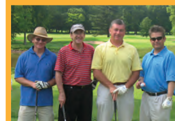
Infineum USA L.P.

Nearly 100 individuals and business representatives throughout Union County, hit the golf links at Shackamaxon Golf & Country Club in Scotch Plains to support United Way of Greater Union County’s work in making a difference in people’s lives and addressing critical community needs.