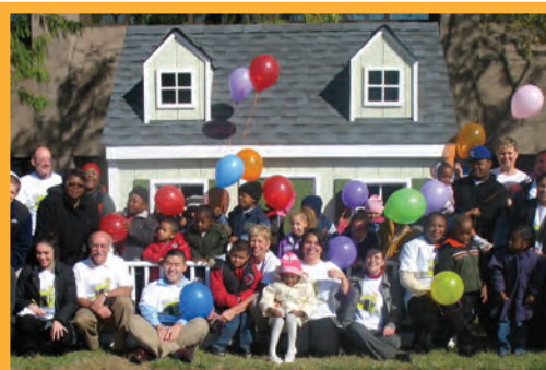
Infineum USA L.P.

Every year, United Way of Greater Union County mobilizes its volunteers and community partners to lend a helping hand for the Season of Caring. To date, hundreds of volunteers have participated in Day of Caring Events and donated their time for the greater good. Close to fifty Union County companies held donation drives to help the underserved.