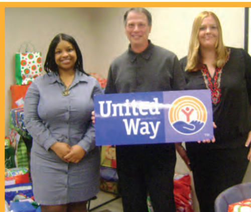
Lerner, David, Littenberg, Krumholz & Mentlik, LLP