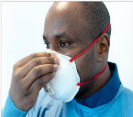
Figure 7. Fitting the respirator's metal nose clip

If a face mask (surgical mask) is worn as substitution for a respirator (Figure 8), it is important to correctly position it on the face and adjust it with the metal nose clip (Figure 9) in order to achieve a proper fit.