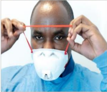
Figure 6. Wearing of a FFP (class 2 or 3) respirator

The metal nose clip needs to be adjusted (Figure 7) and the straps have to be tightened to have a firm and comfortable fit. If you cannot achieve a proper fit, position the straps crosswise. However, this minor modification could imply a deviation from the recommendations in the manufacturer's product manual.