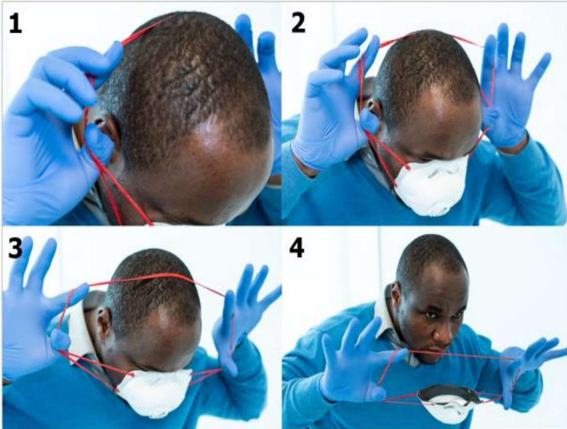
Figure 21. Removal of respirator (steps 1 through 4)

The respirator (or the surgical mask) should be disposed of after removal. It is important to avoid touching the respirator with the gloves (except for the elastic straps) during its removal.